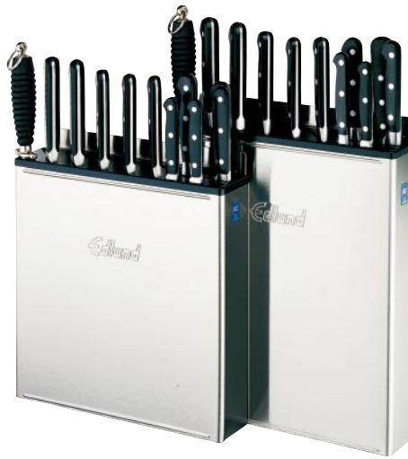
Front view of the KR-99 and KR-100 (14"/35.6 cm longer skirt) with a stainless steel skirt that protects knives and operators from accidents.