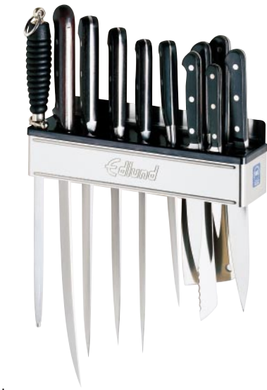
The KR-98 knife rack provides a system of knife storage and retrieval while helping to maintain a sanitary environment. Open underbase allows operators to quickly select the proper knife.