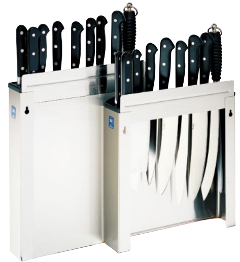
Back view of the KR-99 and KR-100 shows differentiation of the KR-100's stainless steel back for increased sanitation.